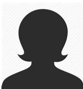
Ife Oyejobi Rights Respecting