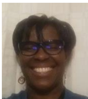
Dun Kuti Early Years Foundation Stage